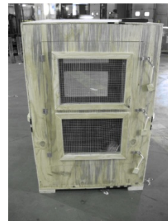
Breed restricted/oversize dog crate