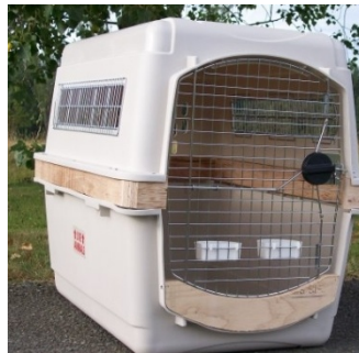
Plastic crate with extender